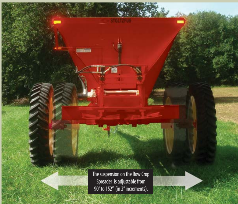
The suspension on the Row Crop Spreader is adjustable from 90" to 152" (in 2" increments).

The axels on the Row Crop Spreader are adjustable from 90" to 152" wheel centers in 2" increments. Engineered for maneuverability in the field and easy change-over of wheel track width.